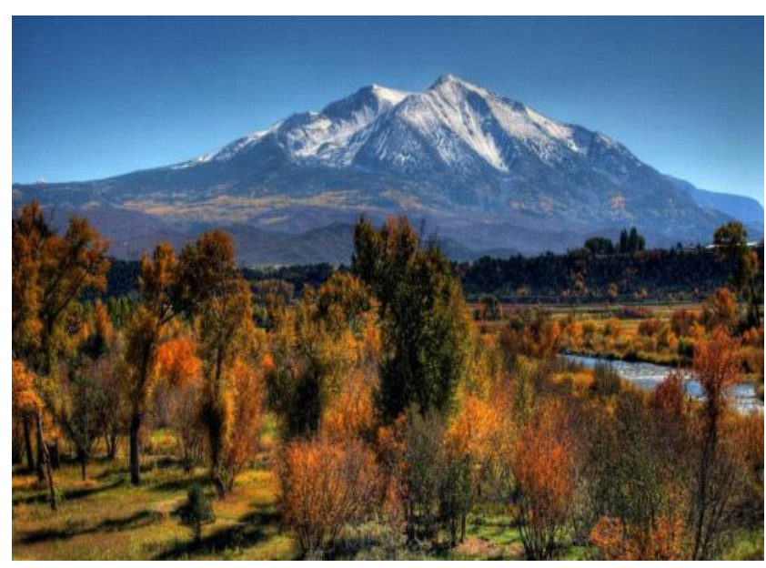
October 10 to 13, 2023 (3 nights) Avalanche Ranch

Our much-anticipated trip to Avalanche Ranch is coming up this October and those, who have been eagerly waiting to join this fun trip, can now sign up by mailing me their checks made out to FSC for $220 . We have nineteen spots. You can find my mailing address on the Club roster.