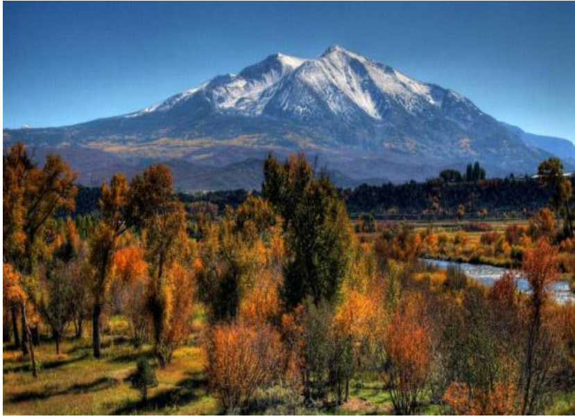
October 10 to 13, 2023 (3 nights) Avalanche Ranch

Seems like a lot of folks want to know when the sign up for our great trip to Avalanche Ranch will open. Be patient. I anticipate starting with the September newsletter. In the meanwhile, I have been asked to announce the cost, so people can plan and budget accordingly.